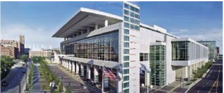
McCormick Place West Building 2301 South Indiana Avenue • Chicago, IL 60616

Concurrent sessions will begin at 1:30 p.m. on Sunday, June 10, 2012, and conclude at 12:10 p.m. on Wednesday, June 13, 2012.